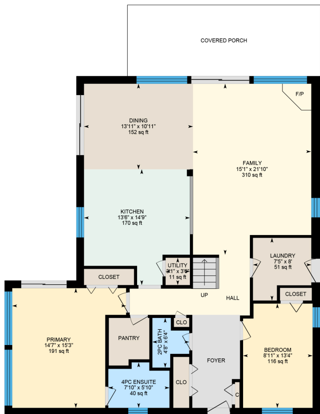
1st Floor Exterior Area 1505.60 sq ft